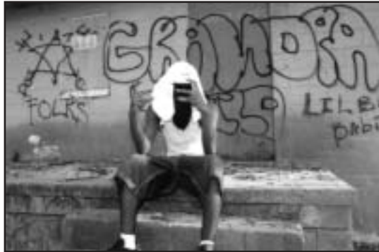
Young male gang members may engage in a substantial amount of graffiti.

Graffiti offenders typically operate in groups, with perhaps 15 to 20 percent operating alone. 10 In addition to the varying motives for differing types of graffiti, peer pressure, boredom, lack of supervision, lack of activities, low academic achievement, and youth unemployment contribute to participation in graffiti.