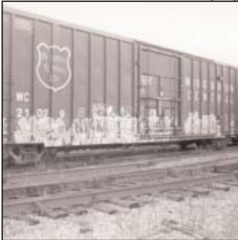
Graffiti is commonly found in transportation systems, such as on the side of this railroad car.

† Most sources suggest that paint-over colors should closely match, rather than contrast with, the base. Contrasting paint-overs are presumed to attract or challenge graffiti offenders to repaint their graffiti; the painted-over area provides a canvass to frame the new graffiti.