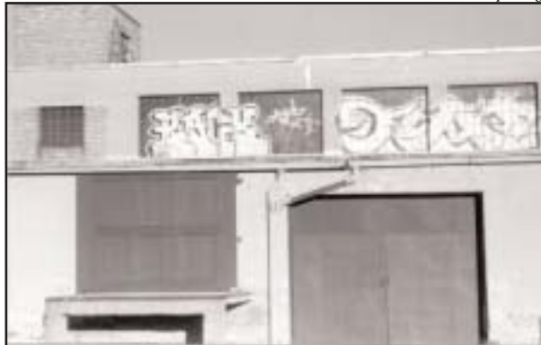
Graffiti often appears in hard-to-reach yet highly visible locations, such as on the upper-story windows of this warehouse.

In addition, two types of surfaces attract graffiti: