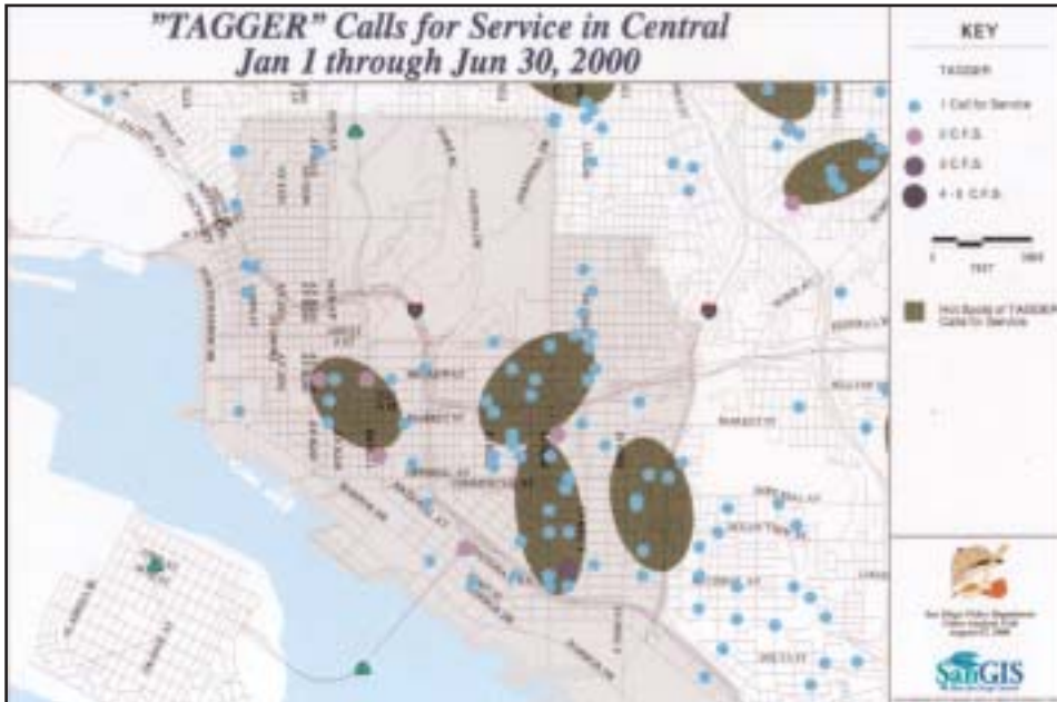
Fig. 1. Map showing locations of graffiti.